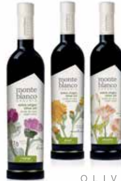
OLIVE OIL ORGANIC