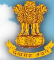
Government of India