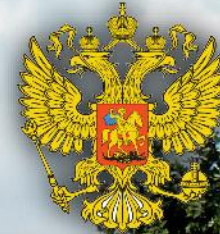
Government of Russia